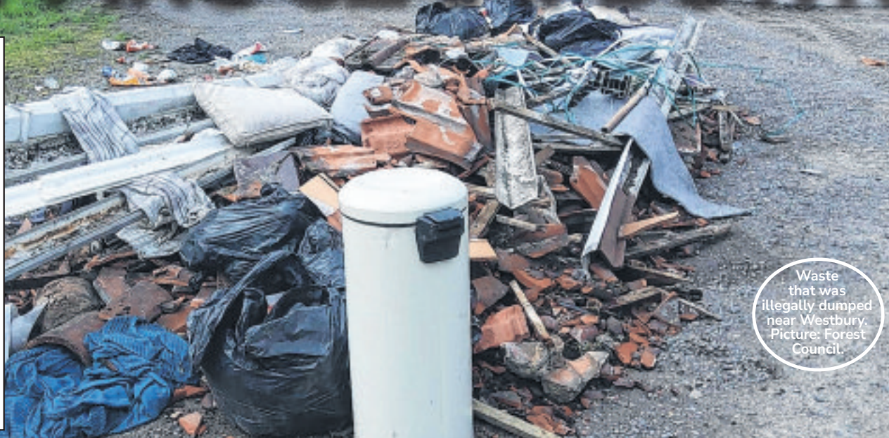
Waste that was illegally dumped near Westbury, Picture: Forest Council.